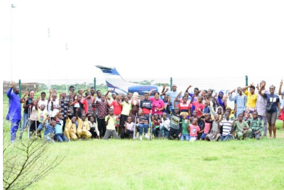
CHILDREN CARAVAN 2019 GROUP PICTURE