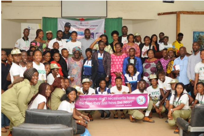
GROUP PICTURE AT K&TRC 17TH ANNIVERSARY