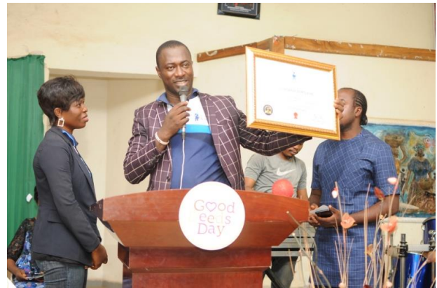
THE CEO OF K&TRC PRESENTING AN AWARD TO THE ED