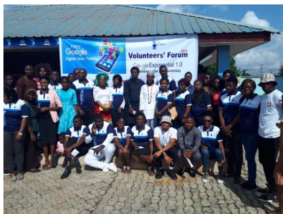
VOLUNTEERS' FORUM 2019 GROUP PICTURE