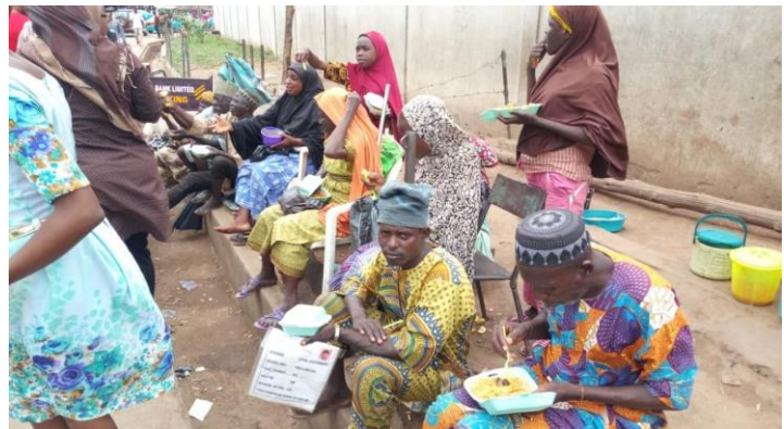
WORLD HUNGER DAY EVENT AT AKURE POST OFFICE