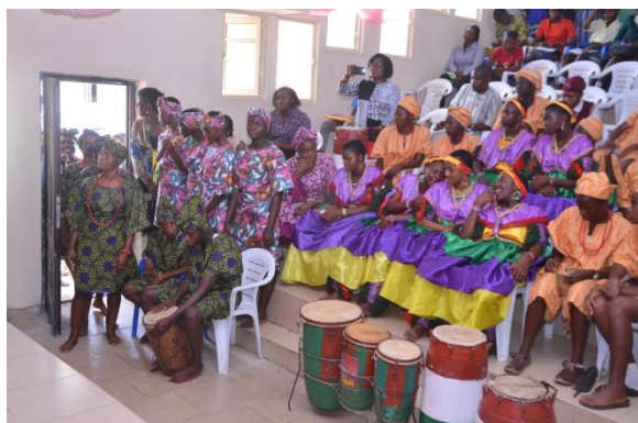
CHILDREN CULTURAL FIESTA 2019 CROSS SECTION PICTURE