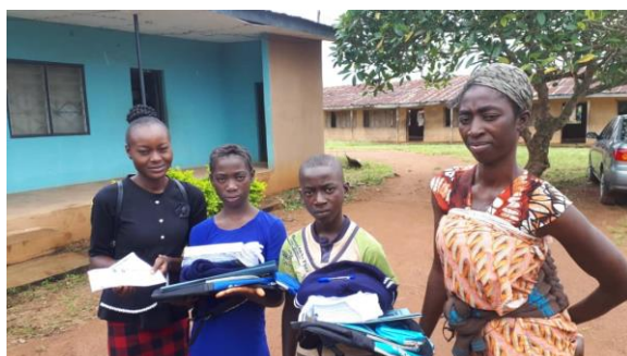
VULNERABLE CHILDREN BENEFICIARIES