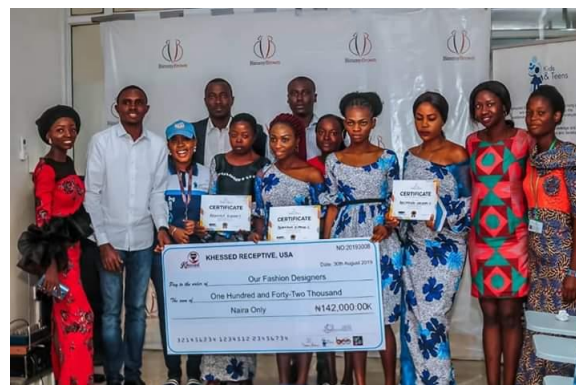
GRADUATION CEREMONY OF THE EMPOWERED GIRLS IN FASHION SCHOOL