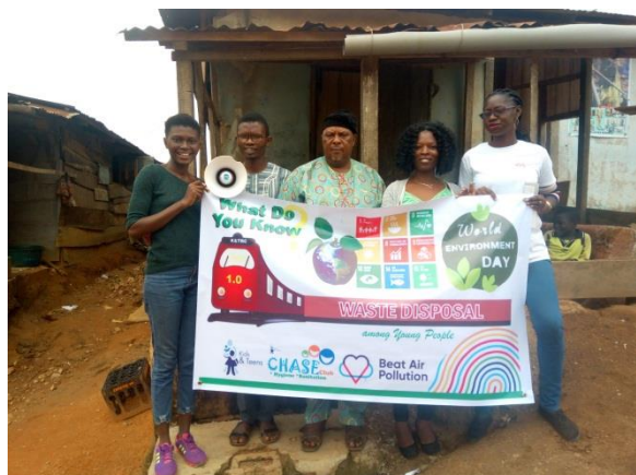
SENSITIZATION PROGRAMME IN ARAROMI ON WORLD ENVIRONMENT DAY