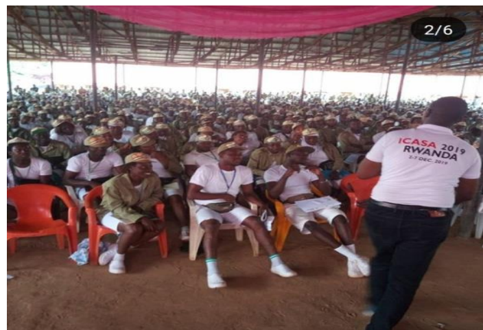
HIV SENSITIZATION PROGRAM FOR CORPS MEMBERS