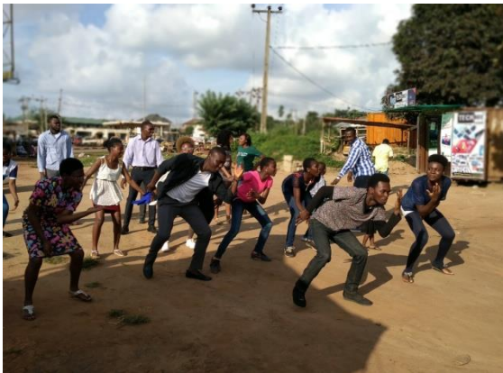
IYD OPEN MATHS DANCE